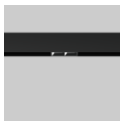
L2 MOVE IT 45