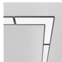
TASK S suspended system