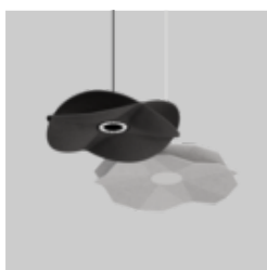
SOUNDCATCHER acoustic suspended