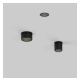
MOVE IN round recessed