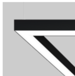
MINO 100 ceiling / suspended system