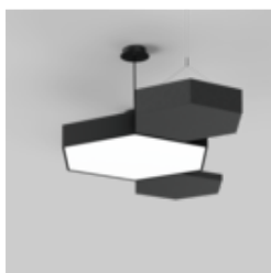
HEX-O suspended group