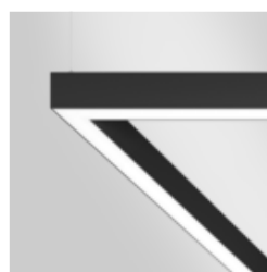
MINO 60 direct / indirect suspended system