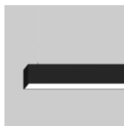
LITO 60 suspended