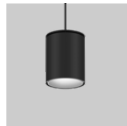
SASSO 100 round suspended