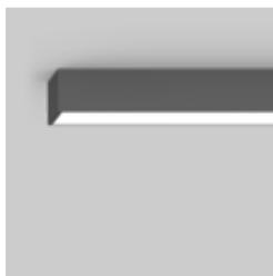
BASO 60 IP54 surface