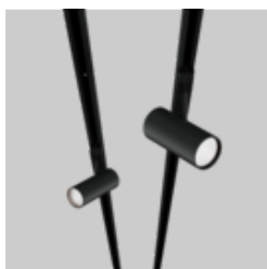
BO 55 / 70 track