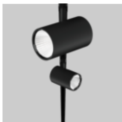
VARO 80 / 110