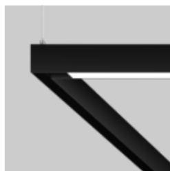
MOVE IT 25 surface / suspended system