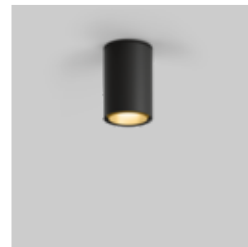
SASSO 60 round ceiling