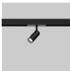
JUST 32 FOCUS MOVE IT 25