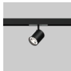
JUST 55 MOVE IT 25 / 25 S / 45