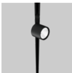
VARO 80 S