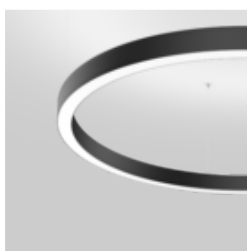
MINO 60 CIRCLE suspended