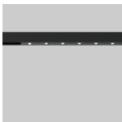
SPOT LINE MOVE IT 25