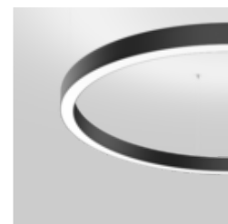
MINO 60 CIRCLE suspended