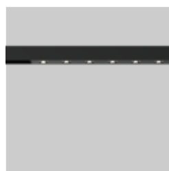
SPOT LINE MOVE IT 25