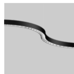
BETO ceiling / suspended system