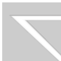
FRAME 100 trim system