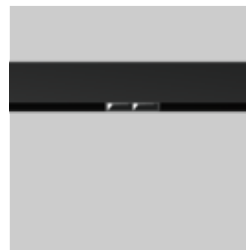
L2 MOVE IT 45