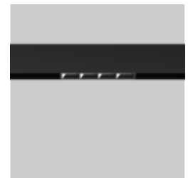
L4 MOVE IT 45