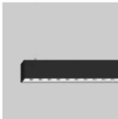
BASO 40 suspended