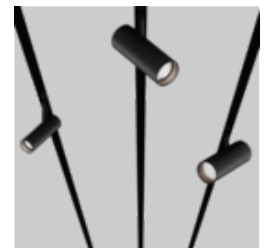
BO 32 / 45 / 55 intrack