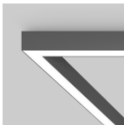
BASO 60 IP54 surface system