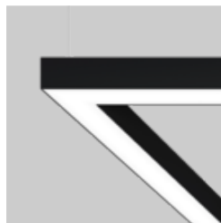
MINO 100 ceiling / suspended system