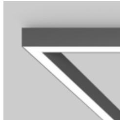
BASO 60 IP54 surface system