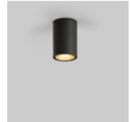
SASSO 60 round ceiling