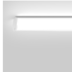
TUBO 100 surface