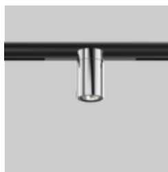
TARO MOVE IT 10