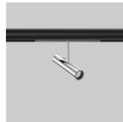
TILA adjustable MOVE IT 10