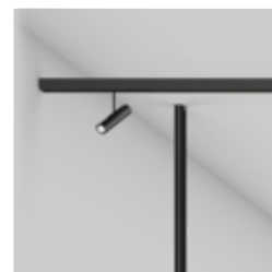
MOVE IT 10 square / round pole system