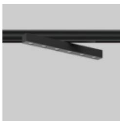
GIRA MOVE IT 10