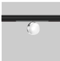
NOBA adjustable MOVE IT 10