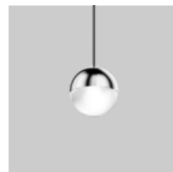
NOBA suspended MOVE IT 10