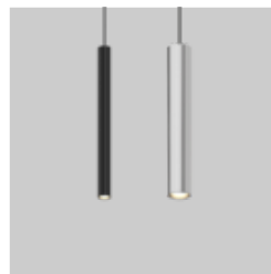
TULA MOVE IT 25 / 25 S / 45