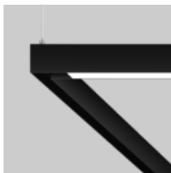
MOVE IT 25 surface / suspended system