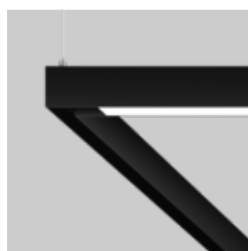
MOVE IT 25 surface / suspended system