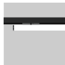
PIVOT MOVE IT 25 / 45