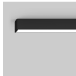
MINO 60 surface