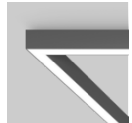
BASO 60 IP54 surface system