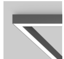
BASO 60 IP54 surface system