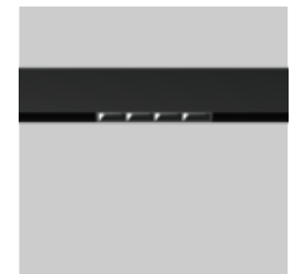
L4 MOVE IT 45