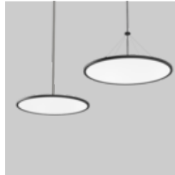
TASK round suspended