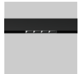
L4 MOVE IT 45