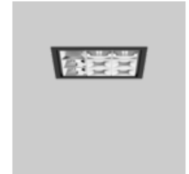
UNICO Q9 basic recessed