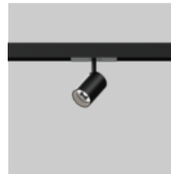
JUST 45 MOVE IT 25 / 25 S / 45