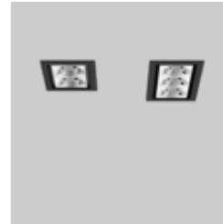
UNICO L2 / L3 basic recessed