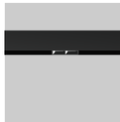
L2 MOVE IT 45