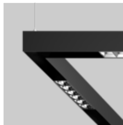
MOVE IT 45 surface / suspended system