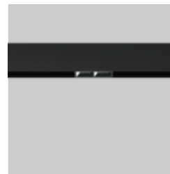
L2 MOVE IT 45