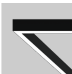
BASO 40 surface / suspended system