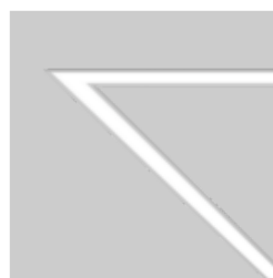
FRAME 60 trim system