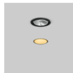
SASSO 60 round recessed 1 lamp