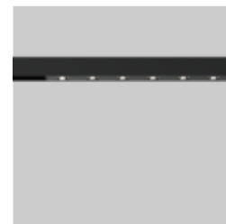
SPOT LINE MOVE IT 25