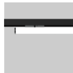
PIVOT MOVE IT 25 / 45