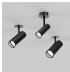
BO semi-recessed / surface