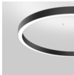
MINO 60 CIRCLE suspended