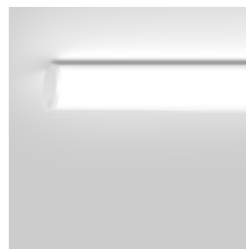
TUBO 100 surface