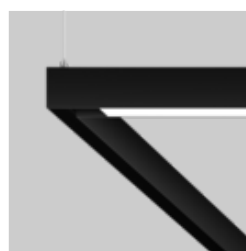
MOVE IT 25 surface / suspended system