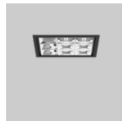
UNICO Q9 basic recessed